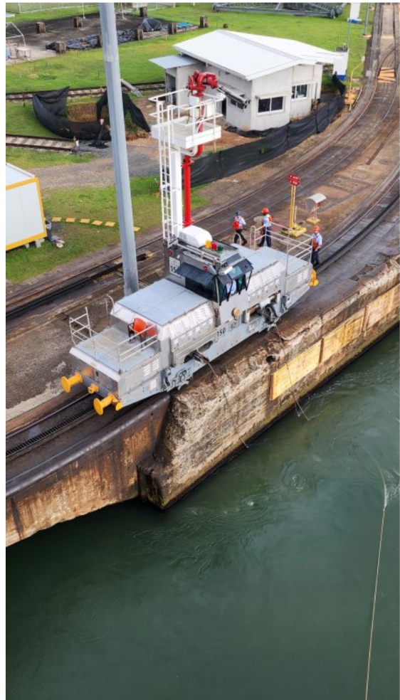
These are the mules that guide the ship