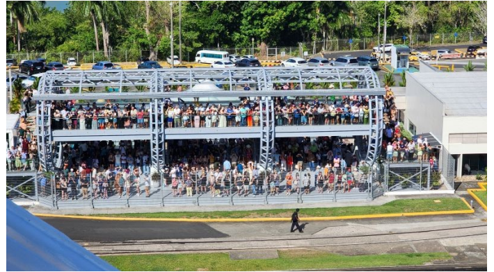
Viewing Platform for the canal.